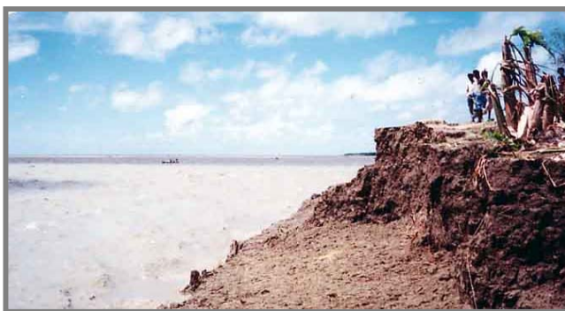
Loss of Homestead due to river erosion

which is approximately in the speed of two millions cubic feet per second, this are causing high level of river erosion, which has caused severe plights to approximately 15,000 poor families of 14 unions of Bhola sadar , Daulatkhan , Borhunuddin , Tazimuddin , Char Fassion and Monpura Upazila most of whom lost their homestead in overnight in unprecedented way, e.g., around half kilometer of area eroded by one night in Dhonia and Mirzakhalo union. Most of these poor families have to take shelter in high embankment or in high land area in subhuman condition or take shelter with relatives in nearby area or going around aimlessly with all the belongings in a truck and trolley with family for a piece of land or migrating to Dhaka. They need shelter, housing and land. And who took shelters they need food, medical, water and sanitation