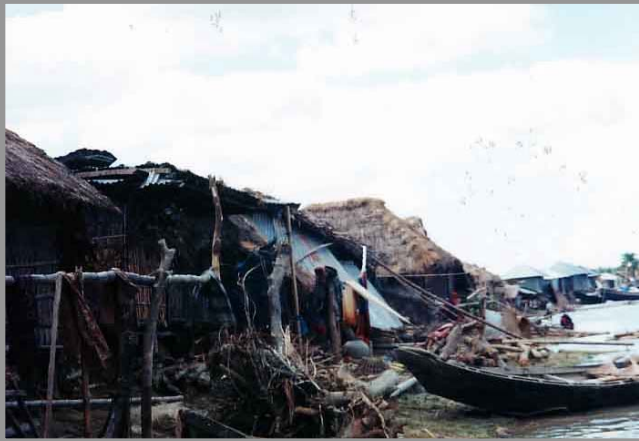
Families are wondering temporary shelter on the riverside embankment.

Apart from this short term immediate measures COAST is planning a long term study to assess the impact of river erosion on poor families, identify the trend of erosion in Bhola and to propose appropriate measures in respect of river erosion from national level in considering this as disaster too. We believe that there would be an strong advocacy issue to keep the government owned land and emerging sandbar islands should be kept for rehabilitation of those river eroded families. COAST has already started and lobbying in this regard.