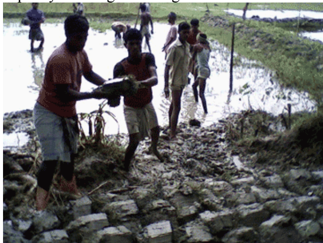
Villagers repairing the damage road through cash for work under rehabilitation program of COAST

which is not safe for cyclone (iii) in nearby mainland where the supply line is crucial, it has offices to facilitate including in district and upazila headquarters with standby generator and internet facilities, but there are no storing system, there are only one pick up transportation vehicle in Bhola, (iv) trained paramedics are available in most of the chars and islands, but they are few, health program running with micro finance income support but these are very limited, (v) it has huge local staff who are experienced in emergency operation, but they are not trained, apart from these in locality volunteers are needed, and (vi) the organization believes in capacity building of local government and