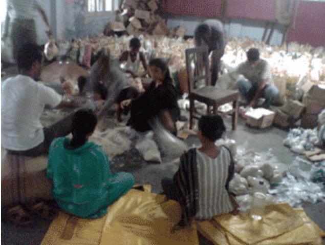
Staffs are making packet the relief materials in COAST office

in the coastal area has increased, and (iii) Promoting advocacy for climate adaptation justice for coastal poor in Bangladesh, this is fundamental need to sensitize national level policy makers to give proper attention for long