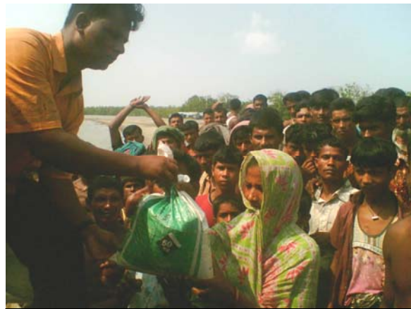
COAST Staff are distributing relief in Dhalchar

COAST has developed a disaster mitigation fund worth of 45,000 US$ (one US $ = 60 BDT) with regular contribution from its micro finance income since 2002, but this fund already has spend around 18,000 US$ due to the immediate relief operation in response to cyclone SIDR and AILA, now it is reduced to the amount of 27,000 US$. It is most important the pre cyclone 48 hours and post cyclone first seven days, COAST do like to conduct this immediate operation (pre 24 hrs and post seven days) with this own fund, as getting donors and outsiders in relief and rehabilitation that takes time. Now we are contemplating to increase the fund with more innovative ideas and external civil society participation. Apart from this the organization has following capacity aspects in this regard (i) two rescue boats in both Bhola and Coxsbazar,