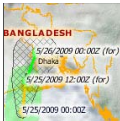
The Path way of Cyclone Aila

Along with other parts of the country, cyclone Aila also hits Charkukrimukri, Chapatila, Dhalchar, Charnizam and Monpura and the coastal unions of main lands especially