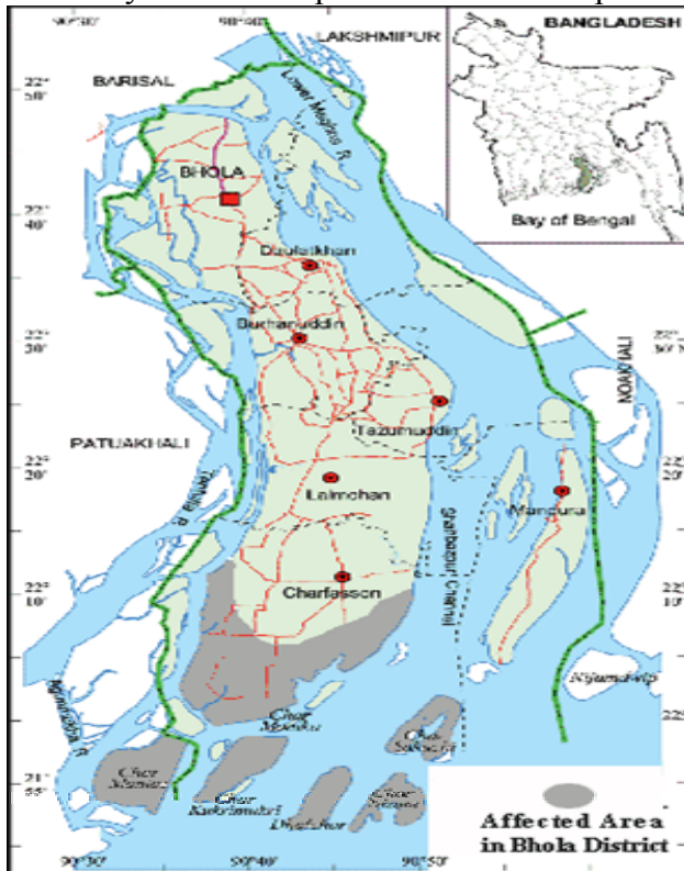
Map of cyclone impact in different chars and islands in Bhola district.

in the unions of upazila Charfassion, Tazimuddin and Daulatkhan of Bhola districts on 26 th May with wind speed of 80 to 100 Kph