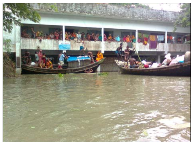
This is COAST office cum cyclone shelter in Dhalchar which is inundated by tidal surge of cyclone Aila. People are taking shelter by boat.

COAST has realized that there should be three level of work in this relation, the course of actions are (i) long term rehabilitation work in Dhalchar, Charkukrimukri, Charpatila and Charnizam, as these are the remotest chars /sandbars islands, where hardly government facilities are available and any one willing to go, COAST has long time involvement and establishment there, (ii) development of COAST sustainable capacity to response disaster for remote coastal areas so that there will always be a stand by people centered organization. This is imperative now as the climate change impacts are